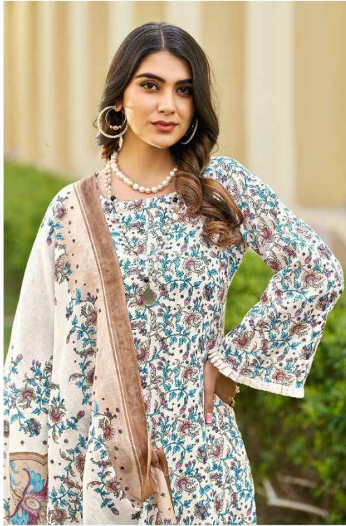
Dresses, resembling wine, require expert craftsmanship and the use of the finest fabrics to reveal their quality.